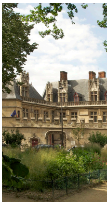
Musée de Cluny