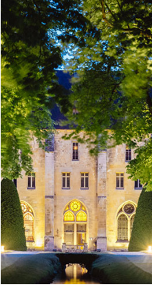
Abbaye de Royaumont