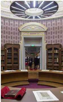
Bibliothèque de l'École des chartes