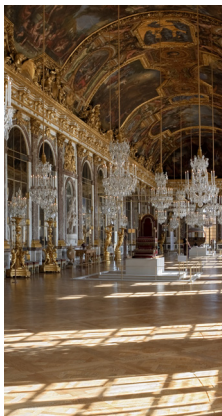
Galerie des glaces, château de Versailles, Versailles